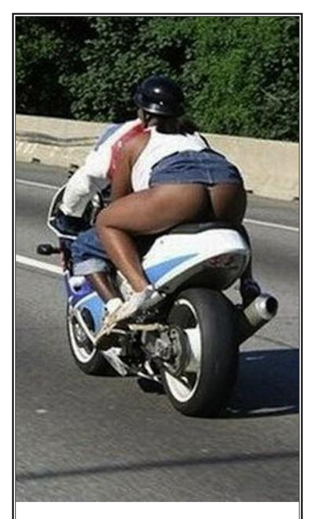
Say "NO" to Crack