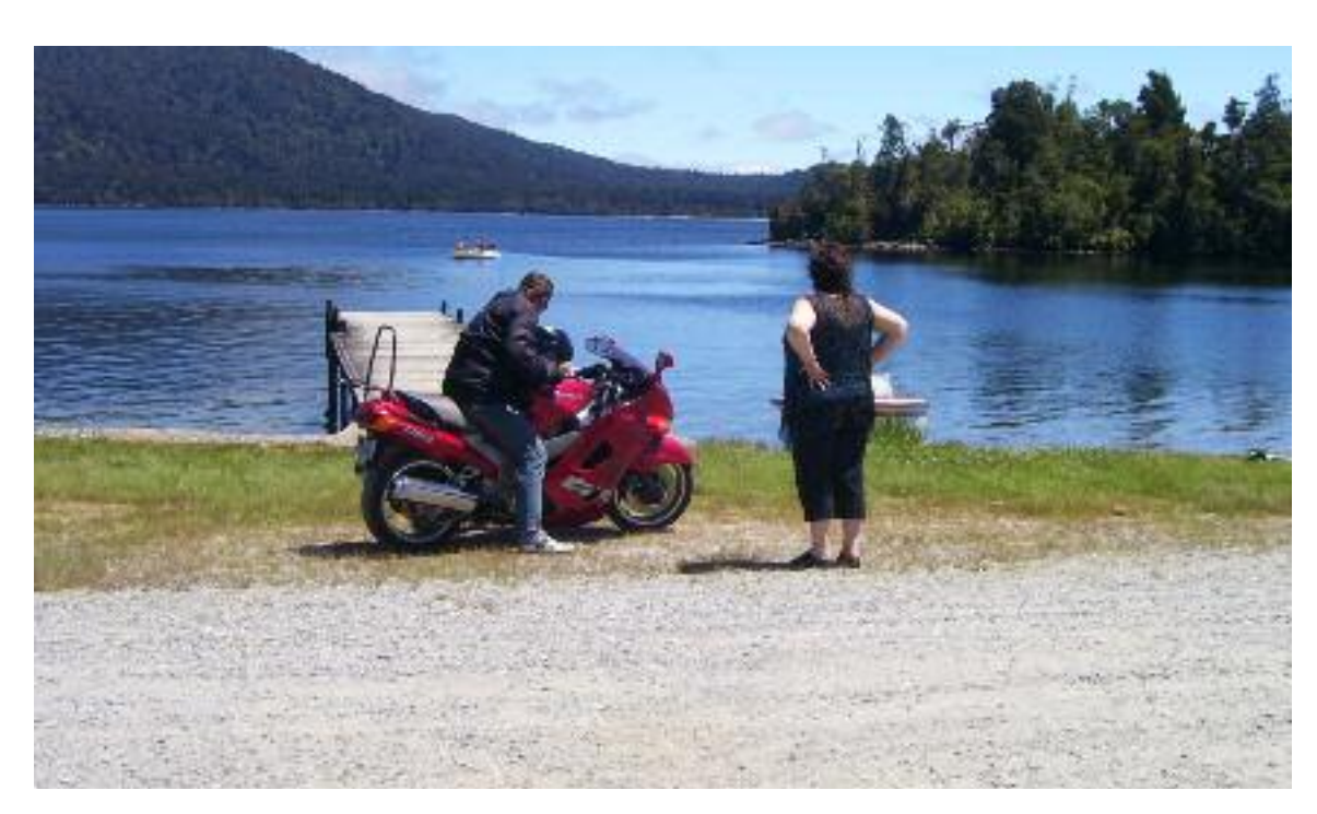
Me on my brothers bike recently at a lake just outside Hokitika

I grew up on the West Coast of New Zealand's South Island, in a small town called Hokitika with a population of about 3,500 people. For those of you who haven't been or are not familiar with the West Coast, it can be a wild and rugged place, famous for it's heavy rainfall and beautiful, diverse scenery. In my early years, it didn't take me long to realise school was not my strong point, and so when I was offered an apprenticeship as a butcher at the tender age of 15, I naturally jumped at the chance. It was only a small butcher shop which I had worked in before as a younger schoolboy, so I was familiar with the routine and work that needed to be done. Leaving school at 15 seemed like a great idea at the time, but looking back (and as you probably expected) I didn't really put much thought into it or anything else. All I seemed to see was that little figure on the bottom of the receipt of my first pay check, which directed me straight towards the local bike shop.