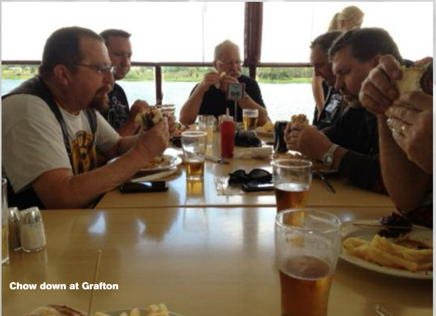
Chow down at Grafton