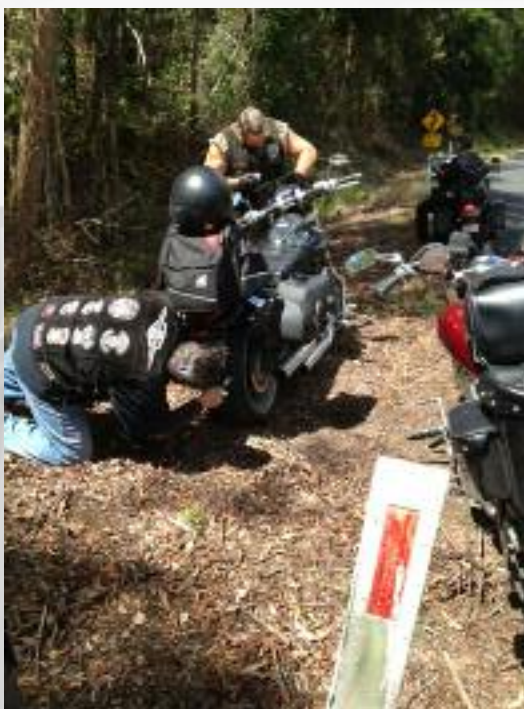
Repairs on the run.... the flat tyre gets fixed

booked at the Riverside Caravan Park for the night. We all had nice little cabins that were quite comfortable and clean, but only a few of the guys were able to park their bikes under cover. By this time we had started it get a bit of rain. After we settled in, we decide to go to the pub for dinner which was "just up the road.".....10,000 miles later we arrived at the pub, re hydrated ourselves and had dinner. The food was great and after a few more drinks, Sarge, Grumpy, Ynot and I decided to head back to the caravan Park for a night cap and hit the sack.