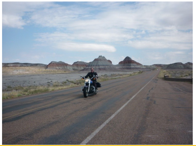
The Steel Horse — October 2011—page 5

It didn't take long to realise that this was not going to be a laid back holiday, but once you realised it was a real adventure, everything seemed to make sense - it was all about the ride and the history of Route 66. From then on we all started to concentrate on riding as a group and enjoying such an amazing experience. Over the next few days, we travelled along the old (and new) Route 66, stopping along the way to meet various colourful characters and see places that have formed part of American folk law; that is visiting the home of the 'corn dog' and crossing over the mighty Mississippi River into St Louis, Missouri.