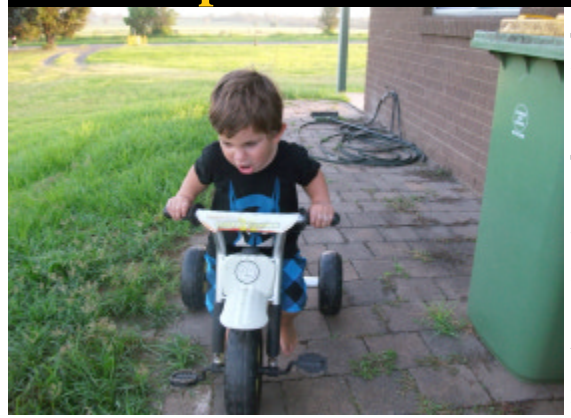
A new club member I think he's riding a VTX Honda!

The weather was overcast so I put on my leather jacket expecting rain but what a mistake that was. On the way to Goodna the sun came out and I cooked inside the jacket all day.