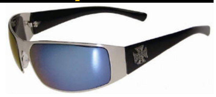
Chopper sunglasses $15