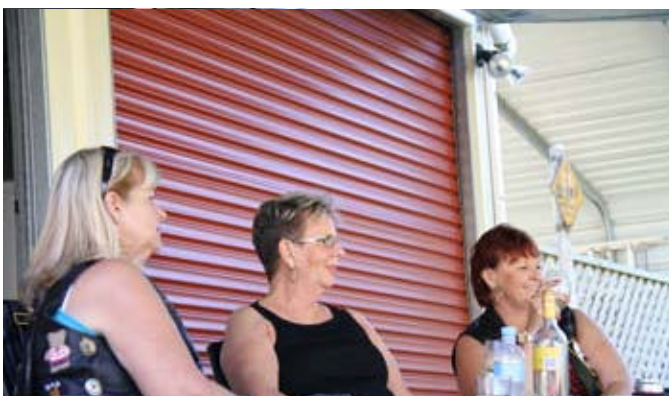
Personally, I think it would look better over there...