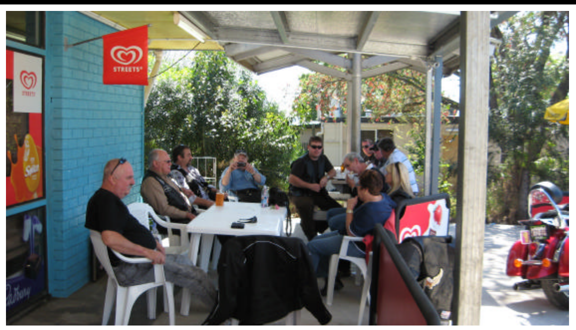
Where we ate on the 1<sup>st</sup> club ride

GO IN PEACE. YOU HAVE JUST BEEN SCREWED BY THE SISTERS OF ST. FRANCIS. SERVES YOU RIGHT, YOU SINNER